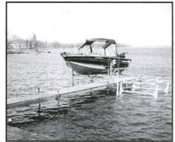
3000 lb. Vertical

As we consistently hear from our customers, "Our dock will be there long after we are gone, and our lift is so easy to operate, we use our boat more often."