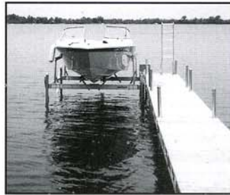
4000 lb. Vertical