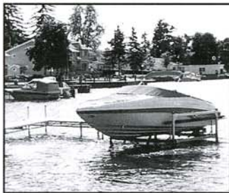
4000/5000 lb. Vertical

Competition: Light duty, won't hold up; cannot be used as a boarding step; welds typically break, not adjustable or they will use inexpensive VEE chocks providing minimal hull support and poor hull alignment.